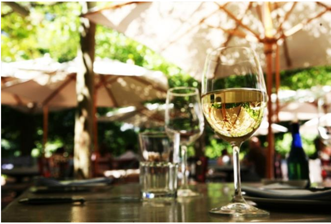
Bread & Wine

This morning we will visit a unique Motor Museum at L'Ormain's Wine Estate, featuring 100 years of motorcars and cycles. Lunch is at Bread & Wine on the Moreson Farm Wine Estate.