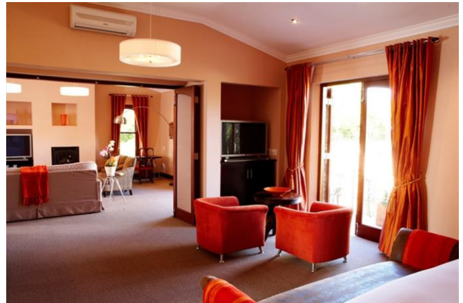
One of four luxury suites